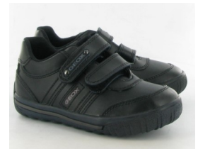
Velcro shoes or trainers.

Shoes that cover the top of your child's foot and have a good grip for outdoor play are safest option.