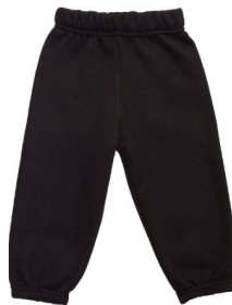
Black joggers or leggings with an elasticated waist.