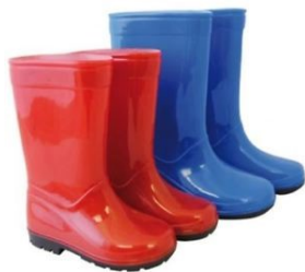
pair of wellies to keep in school.

We aim to offer the children continuous outdoor play in all weathers- To keep them warm and dry. Your child will also need:-