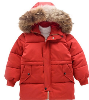
warm, showerproof coat.

All children require a full set of spare clothing (every item clearly labelled with their name). School will provide a bag for spare clothes for every child on their first day.