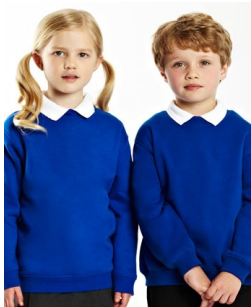
Royal blue sweatshirt or cardigan

Please note that in EYFS Joggers / leggings and sensible Velcro shoes or trainers are support children's independence with self help skills and improve safety particularly in the outdoor environment.