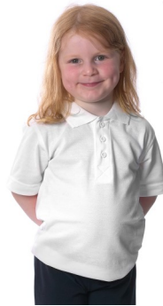
Plain white polo T-shirt with collar